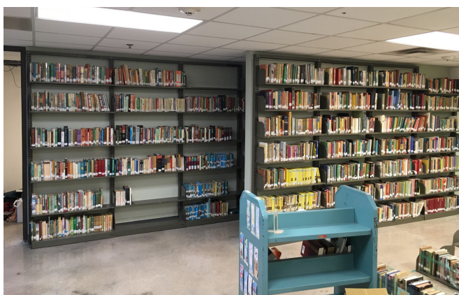
Books were stored in the gym until shelves were ready in the library.