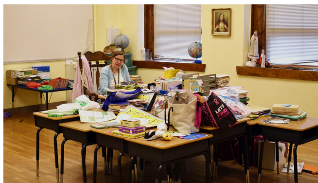
Teachers are preparing for the move.