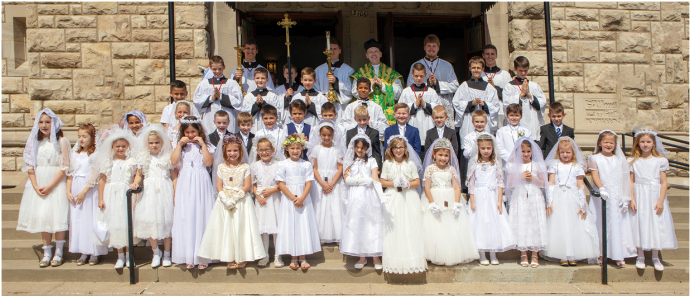
First Holy Communions On June 14 31 children received their first holy Communion.