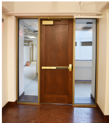
Beautiful doors and the pews have been installed in the chapel.