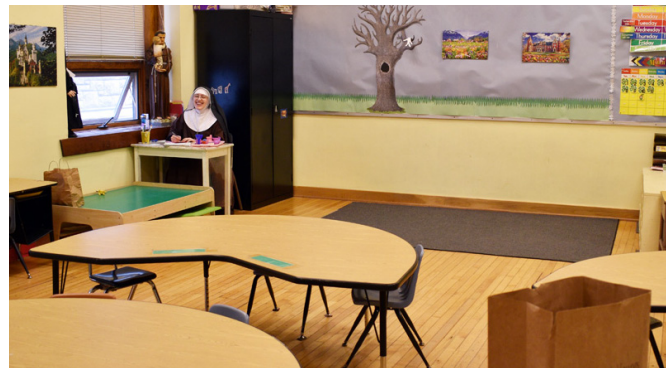
Teachers waited in their empty classrooms for families to arrive on the 22nd.