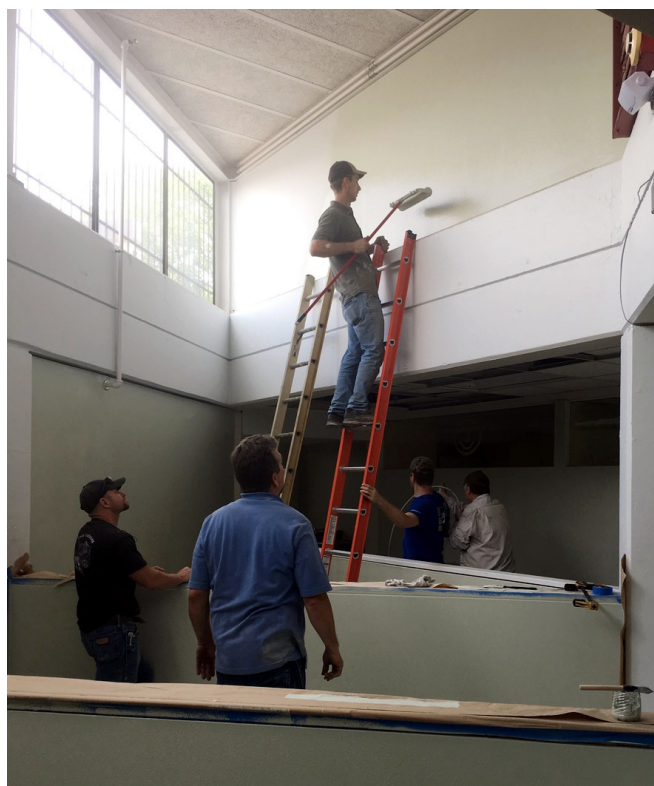
Volunteers from St. Mary's painted the atrium and halls.