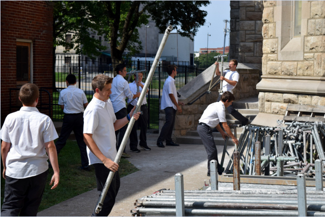
High school boys helped to remove scaffolding from the church.