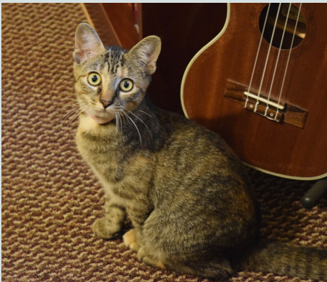
Introducing the newest member of the priory — Catalina, St. Catherine in Spanish, also means “pure”, and can be shortened to “cat”.