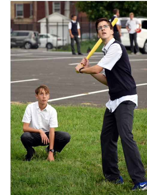
The second annual North American Martyrs intramural wiffle ball tournament between the 7/12 grade boys is well underway.